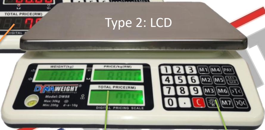
Type 2: LCD